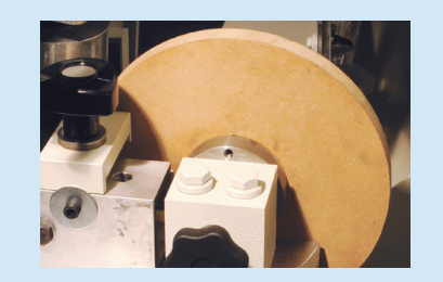
Round backing wood with 6 manual adjustable positions.