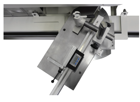
The table can be swivelled 60° in two directions. The working area of the table does not change.

The Pentho Compact 4 has a noise-reduced cut-off saw, tenon heads and two vertical spindles. The machine has a solid table on a stable vertical slide bar. The cut-off capacity of the machine is 150 mm. The total table can be swivelled +/- 60° in two directions. The machine has a dust rejecting transparent safety-screen that moves together with the table and covers the machine completely.